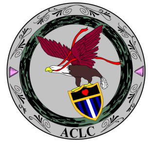
Catch the Patch