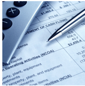
1st Quarter financial report